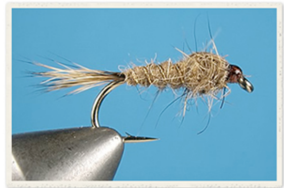
Gold Ribbed Hare's Ear Beginner's Table