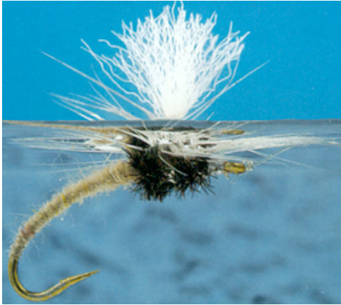
Various Emergers Fresh Water Intermediate