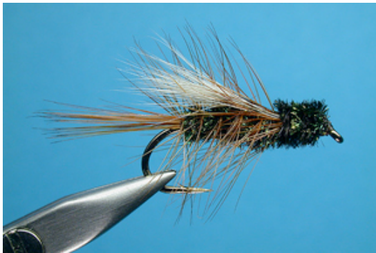
Picket Pin Fresh Water Intermediate

The Picket Pin can be retrieved like a streamer to imitate a bait fish, weighted and fished like a nymph, or tied with elk or deer hair and fished dry (from Stewart and Allen, Flies for Trout ).