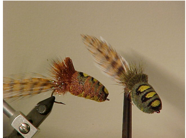
Stacking Deer Hair Fresh Water Intermediate