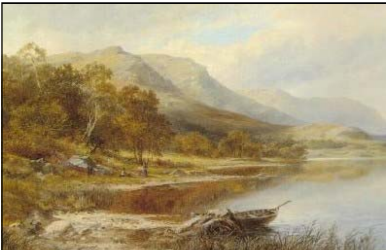
By The Edge of a Lake David Bates, 1873