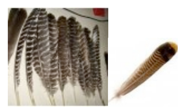
According to Wayne Mumford, the secondary feathers closest to the bird's body are best. Think armpit (wingpit?), which have the best colors.

I hope you all had a good Turkey Day. If you had a wild turkey, I hope you saved the wing feathers and turkey flats for fly tying.