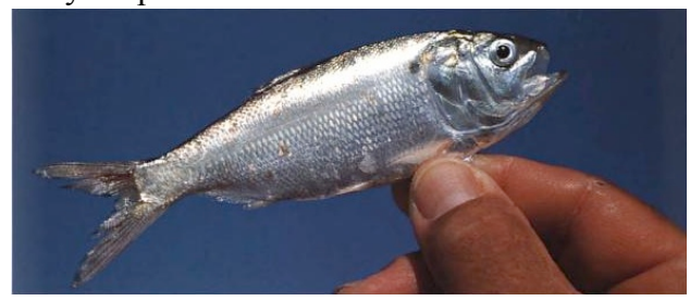
After careful observation of fast-moving baitfish, shape your fly to imitate its shape.