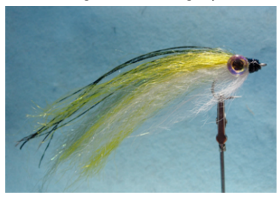
Peter Devine Angelo's Grab Bag Fly

Now... mix well with water... and hold on!!