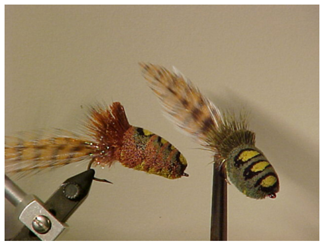
Stacking Deer Hair Fresh Water Intermediate