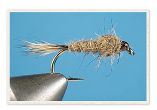
Gold Ribbed Hare's Ear Beginner's Table