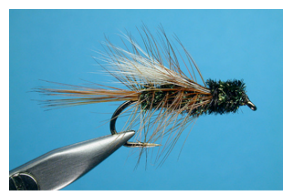
Picket Pin Fresh Water Intermediate

The Picket Pin can be retrieved like a streamer to imitate a bait fish, weighted and fished like a nymph, or tied with elk or deer hair and fished dry (from Stewart and Allen, Flies for Trout ).