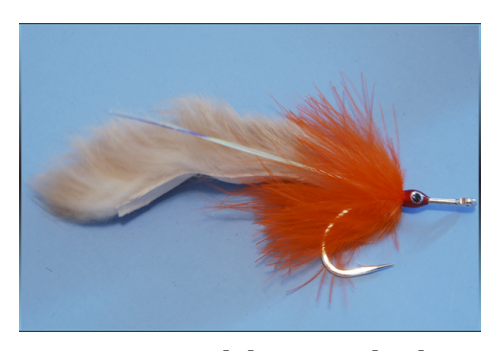
Various Rabbit Tail Flies Salt Water Intermediate