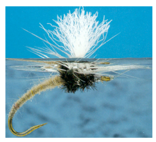
Various Emergers Fresh Water Intermediate