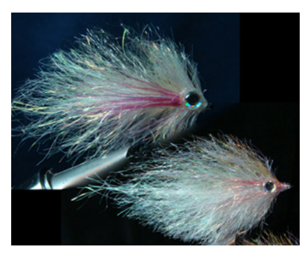
Peanut Bunker Saltwater Intermediate